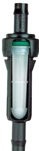
In-Line Filter screen detail