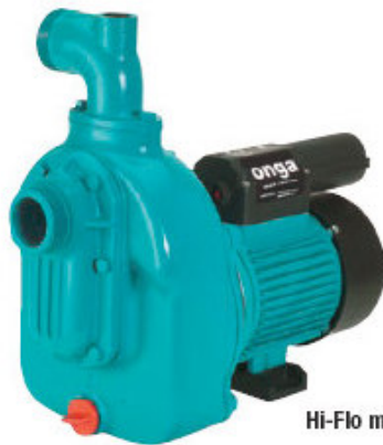
Hi-Flo model 150