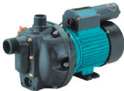
Hi-Flo model 122